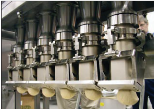
◀ Belshaw Pressure Cutter producing shells (Bismarcks)