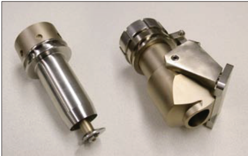
◀ Ring cutter; Shell (Bismarck) cutter

Heavy duty, precision construction throughout ▶