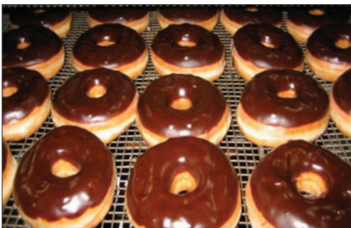
◀ Iced Pressure Cut Rings