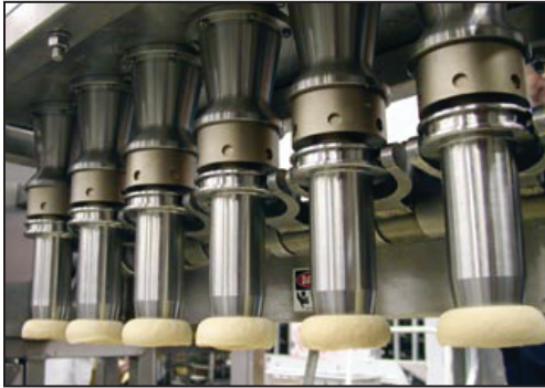
◀ Belshaw Pressure Cutter producing Ring donuts