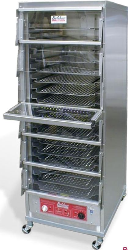
Belshaw EP18-24 Proofer

Cleaning is made easy with removable shelves and doors and a slide in-and-out electrical compartment. All components are heavy duty for commercial use. EP proofers require no plumbing, hard wiring or special installation.