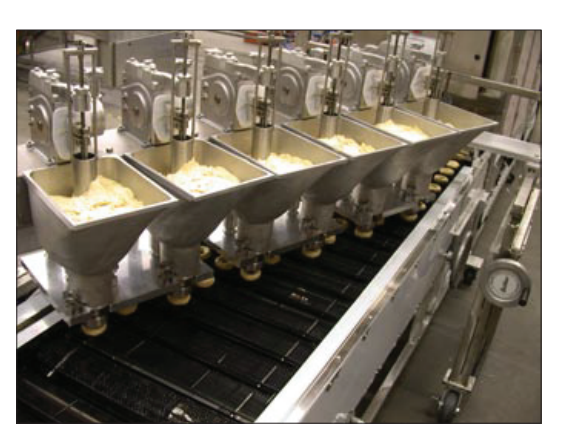
Above: Belshaw Vacumatic – deposits ring donuts directly to automatic proofer