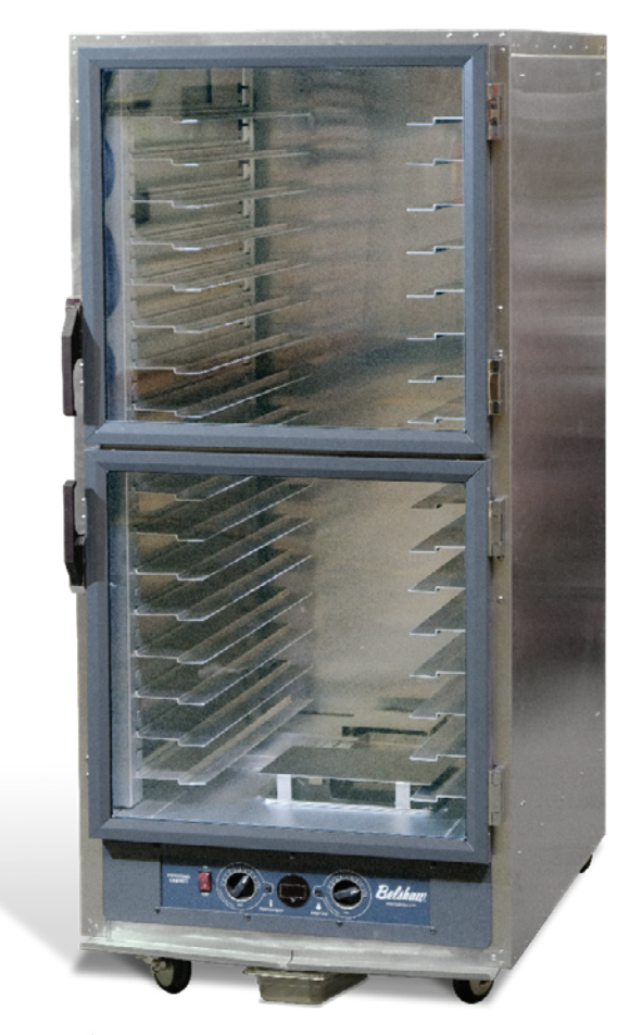
↑ Belshaw CP1/CP2 Cabinet Proofer