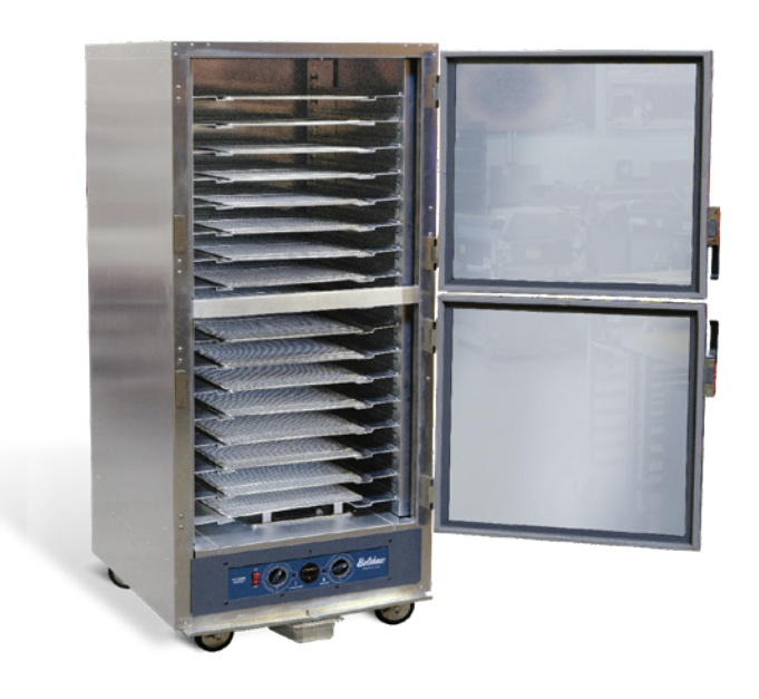
↑ Belshaw CP1/CP2 Cabinet Proofer (shown with donut fyring screens)