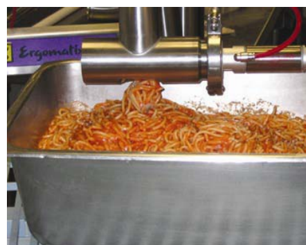
Shown Below with Kettle Connection