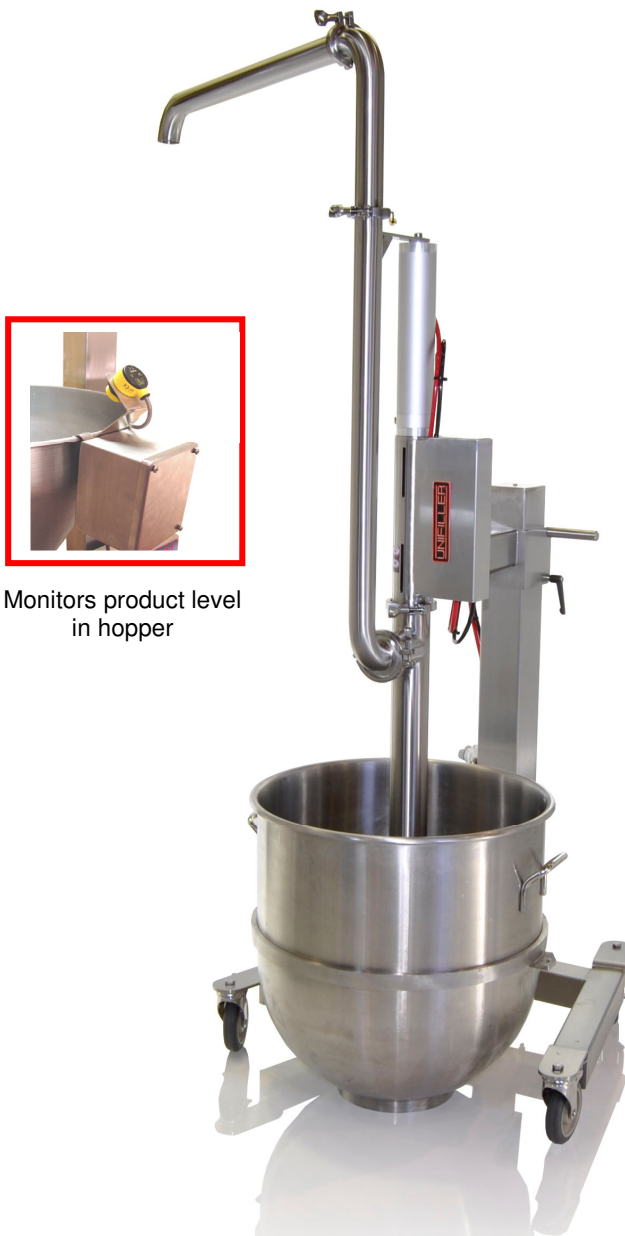
Monitors product level in hopper