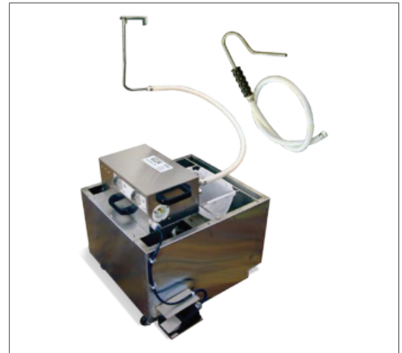
EZMelt 24 Shortening Melter-Filter (w/optional Refill Hose)