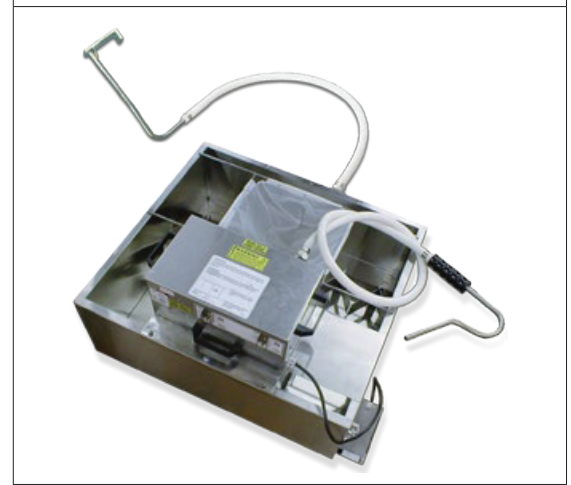
EZMelt 34 Shortening Melter-Filter (w/optional Refill Hose)