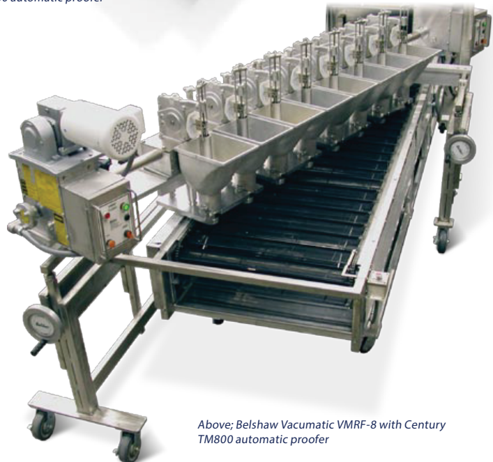
Above; Belshaw Vacumatic VMRF-8 with Century TM800 automatic proofer