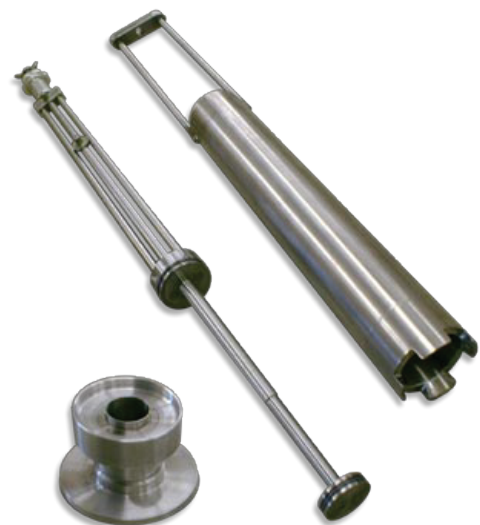
Right: Plungers for Vacumatic (VMRF)

The action of the Vacumatic plunger is designed to minimize stress on the actively rising dough. Plunger sets for Century Vacumatic (VMRF) models are precision-made from high quality stainless steel. For ring donuts in three sizes, using plunger diameters 1-1/8in (29mm), 1-1/4in (32mm) and 1-3/8in (35mm).