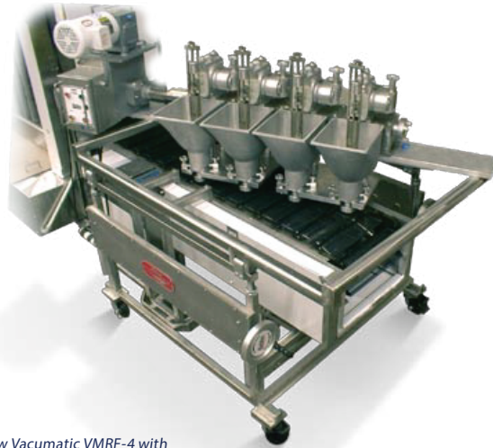
Top; Belshaw Vacumatic VMRF-4 with Century TM200 automatic proofer