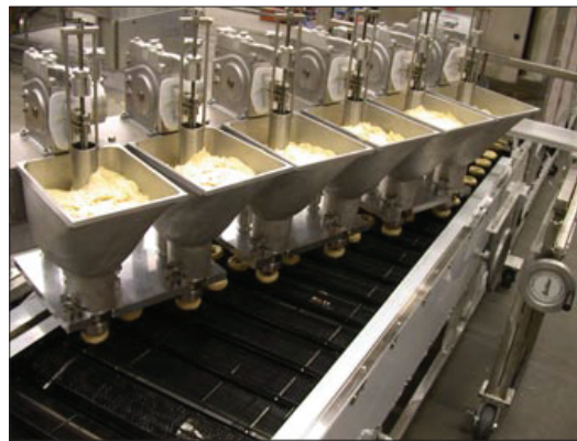
Above; Belshaw Vacumatic - deposits ring donuts directly to automatic proofer