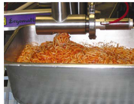
Shown Below with Kettle Connection