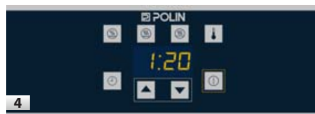
Proofer keypad with set of time, temperature, humidity of the proofer. Two colour display (green humidity, red temperature), for a prompt reading.