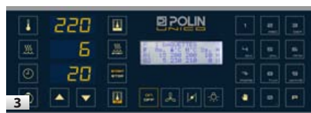
Keypad with 100 programmes, 9 phases each, with a large 4-line LCD.