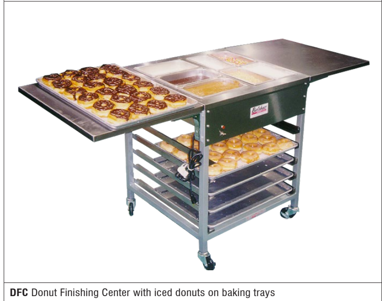
DFC Donut Finishing Center with iced donuts on baking trays