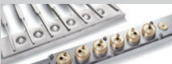
Dies and nozzles