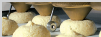
Paper holding device