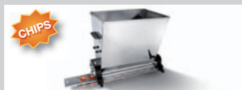
Roller head for “American” type hard dough