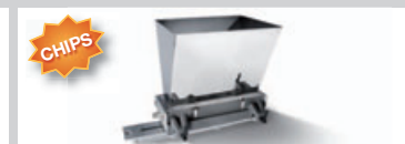
Pump head for soft dough, with alternating teeth gears