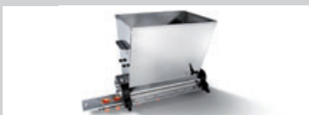
Roller head for hard dough