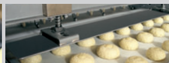
Squashing tips device