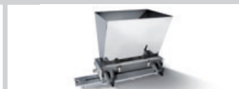
Pump head for soft dough