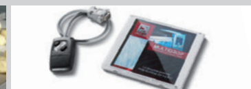
Memory card and Cd Proges Software