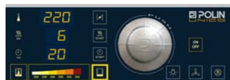
Standard keypad with automatic steam damper and temperature control of the deck.