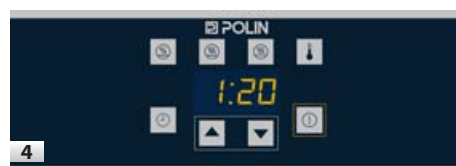
Proofer keypad with set of time, temperature, humidity of the proofer. Two colour display (green humidity, red temperature), for a prompt reading.