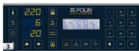
Keypad with 100 programmes, 9 phases each, with a large 4-line LCD.