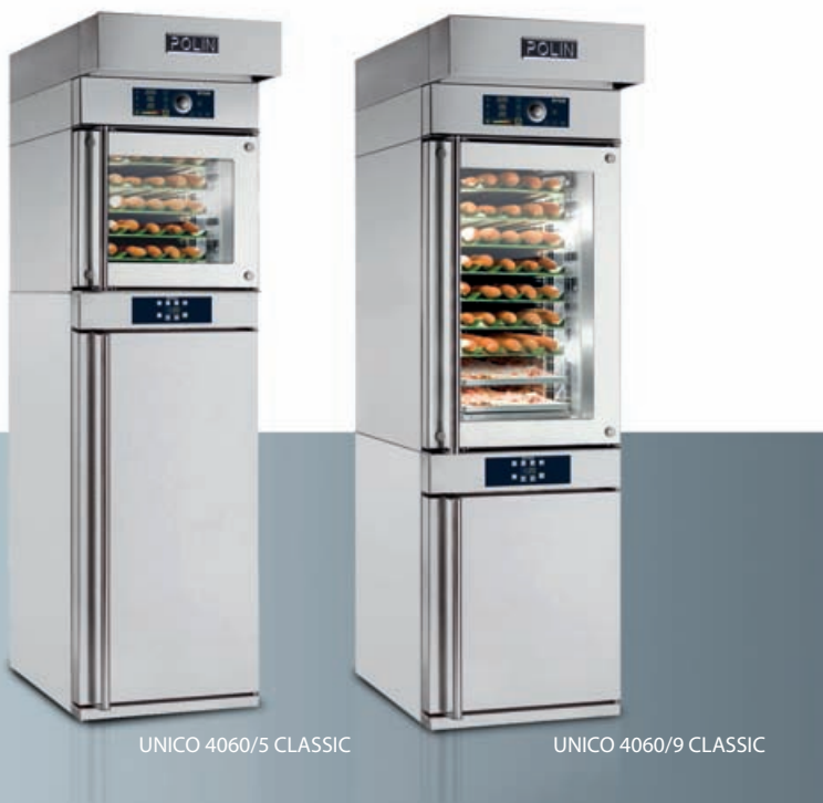
UNICO 4060/5 CLASSIC