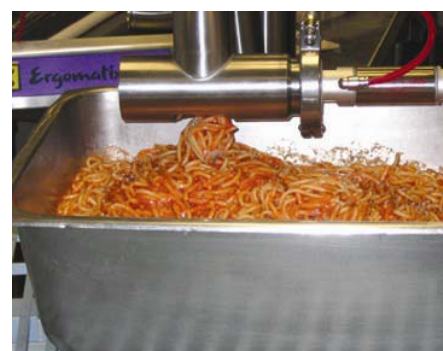
Shown Below with Kettle Connection