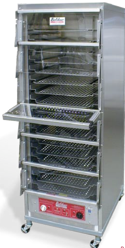
Belshaw EP18-24 Proofer

Cleaning is made easy with removable shelves and doors and a slide in-and-out electrical compartment. All components are heavy duty for commercial use. EP proofers require no plumbing, hard wiring or special installation.